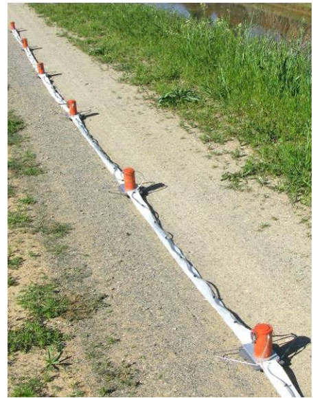
AnySeis™ modules work well with land streamers — the interval between units can be adjusted to the desired spacing, even at the job site.