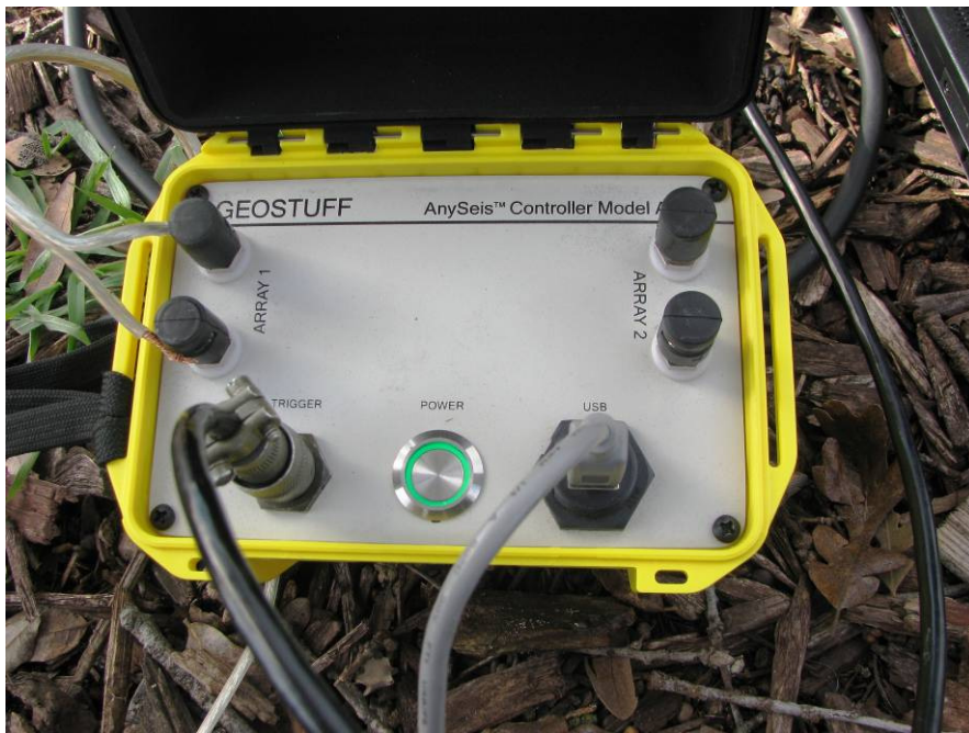
Controller module interfaces the seismic spread to the computer through the USB port. Also connects to the hammer switch. Small 12-volt battery powers string of geophone stations.