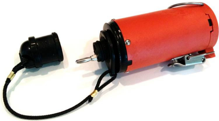
AnySeis™ is also available with connector for use with an external geophone.