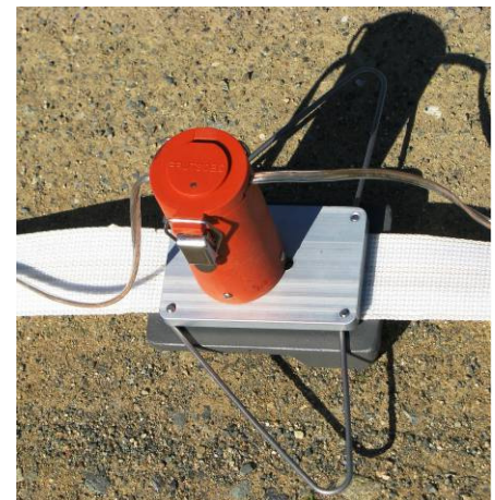
Module screws onto standard top plate

AnySeis™ modules work well with land streamers — the interval between units can be adjusted to the desired spacing, even at the job site.