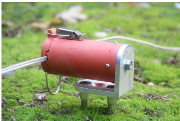
Conduct shear wave surveys with optional bracket. Standard 15-Hz sensor operates in either orientation.